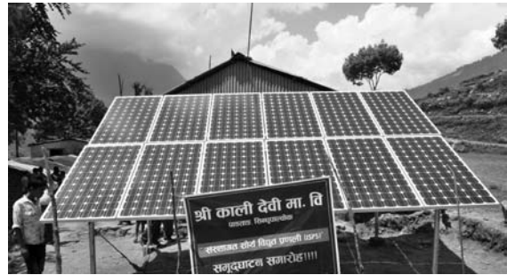
Solar System installed in a rural area of Sindhupalchowk district

This approach of promoting solar home system requires strong quality assurance and monitoring mechanism and qualification of vendors based on financial, physical and human resource facilities as well as quality service providing capacity. Approximately 300,000 household solar home systems and 500 institutional solar PV systems have been installed through vendor sales subsidized model. Subsidy is provided in two ways; direct cash subsidy to users through vendors and indirect subsidy as tax and VAT exemption to