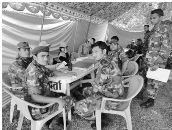
PLA members being verified at Seventh division, Kailali.

The SC has already decided to provide Rs 600,000 to Rs 900,000 for those choosing rehabilitation package and Rs 500,000 to Rs 800,000 for those wishing to go