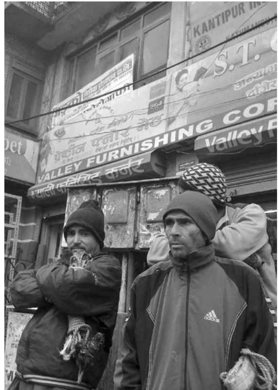
Porters wait at a crossroad of Kathmandu seeking some works.

A comparison of per capita income of lowest and other decile groups against the per capita income of highest decile group shows that a very adverse income distribution pattern has persisted in Nepal. In 1996, for instance, per capita income level of 10th highest decile groups was 20.5 times higher than the lowest income group. In 2011, its per capita income level jumped to 26.4 times in comparison to the per capita income level of lowest decile group. Similar phenomenon is observed from 2nd to 5th lowest decile groups as well. The per capita income level of highest decile group against 2nd decile group rose to 15.3 times in 2011 as against 9.8 times higher in 1996. Even in the 5th decile group, the rise has gone up to 7.3 times against 5.4 times during the same period. This means that, unlike the tendency shown by the consumption based inequality, income distribution pattern has worsened. The national accounts estimates also indicate that the factor distribution or returns to labor and capital has also moved in the opposite direction. According to the estimated compensation to employees and operating surplus, the share of former in total value added has gone down steadily from 46.7 percent in 2001 to 38.1 percent in 2011. Contrarily, the share of operating surplus in total value added has risen to 58.6 percent in 2011 against 50.4 percent in 2001.