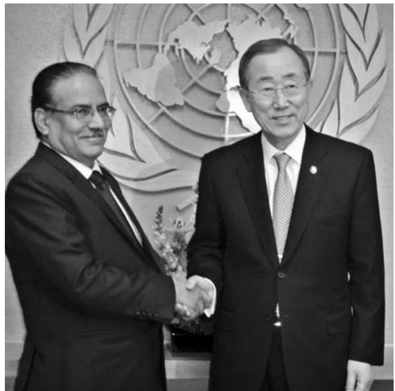
Prachanda shakes hand with UN Secretary General Ban In New York.

A Hong Kong-based Organisation-Asia Pacific Exchange and Cooperation Foundation (APECF)—