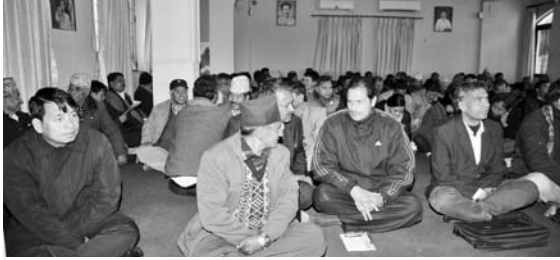
Central leaders of Unified CPN - Maoist in a central committee meeting at central office Peris Danda, Kathmandu.

had followed the suit while making agreement with Chyan Kai-Sek. It is not that Lenin and Mao were blamed for self-surrender by different tendencies. However, history proved Lenin and Mao as correct.